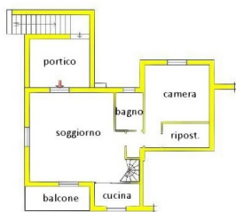
PIANTA PIANO PRIMO