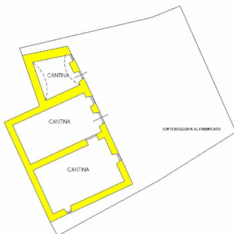
PIANTA PIANO TERRA